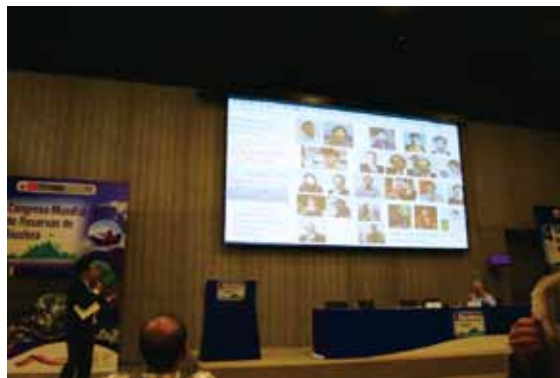
At the 4th World Congress of Biosphere Reserves

OUIK also attended the 4th World Congress of Biosphere Reserves, where it presented on the synergies between GIAHS and BRs, citing Ishikawa as a case study, and on the potential for collaborative study of mountain regions with serving Mount Hakusan BR as a study field.