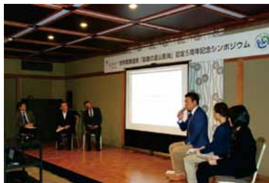
Panel discussion at the anniversary symposium