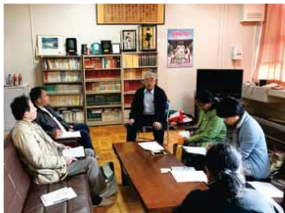
Trainees asking questions about community tourism at Shunran no Sato, a farm stay accommodation in Noto Town

This year, three trainees from Laos and Myanmar participated. In the course of training, OUIK described the GIAHS program introducing examples of designated sites and accompanied trainees on a Noto region tour. We also assisted to facilitate the outcome sharing session, which was held in the course of training.