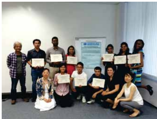
Students holding up completion certificates after their presentation

Foreign exchange students from Kanazawa University and students from UNU's master's and doctoral programs participated. After touring the city's historic-cultural landscapes and related facilities and communities, they presented their findings while contrasting them with their own research themes and policy challenges in their own countries.