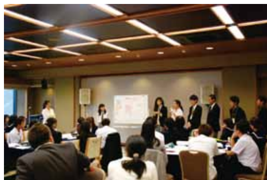
Youth session (students from high schools in Ishikawa/ in Thai and a Russian university)