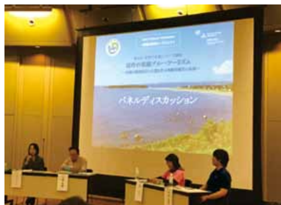
Panel discussion at the fourth session in Hakui city

■ 5th Session: The Role of Local Rivers Linking Satoyama and Satoumi (Sept. 17, Noto Town)