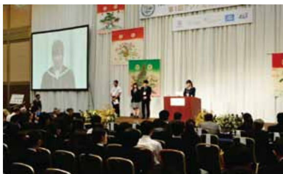
High school students reporting on the outcomes of their workshops at the conference