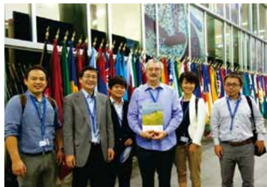
At the COP13 venue: Dr. Dias holding the Ishikawa Declaration (third from the right)

In the same forum, a representative of the SCBD announced that, following the 1st Asian Conference, North American conference on BCD in 2018 is being considered by the American Museum of Natural History and its collaborators. Lastly, at the closing reception, OUIK joined Ishikawa Pref. staff in handing an Ishikawa Declaration pamphlet to CBD Executive Secretary Braulio F. de Souza Dias and thanking him for participating in the international conference. Dr. Dias said that he was deeply impressed that ecologically harmonious traditional cultures are still strong in Ishikawa.