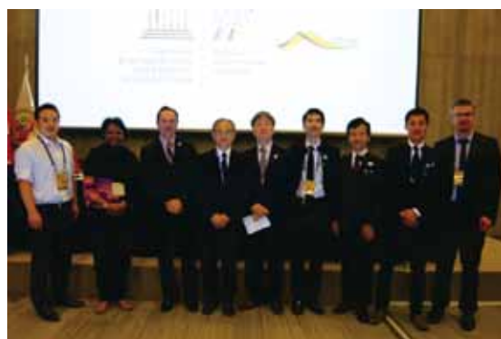
UNESCO officials and Japanese representatives after the extension approval

When registered as a BR in 1980, the Mt. Hakusan area was partitioned into core areas to protect ecosystems and buffer zones to support academic research and educational activities. Mount Hakusan BR Council, formed in 2014 at the initiative of the local communities, applied in 2015 for extension of these zones and the addition of transition area for carrying out sustainable socio-economic activities. The extension was approved in March 2016 at the 28th Session of the ICC of the MAB Programme. This raised expectations of multi-stakeholder involvement in sustainable development of the region. OUIK has supported the council's activities through international networking and other efforts. As part of this work, OUIK published in collaboration with local stakeholders "Mount Hakusan Biosphere Reserve: Creating a new path for communities and nature." The booklet offers a comprehensive understanding of Mount Hakusan BR and activities related to biocultural diversity, and is intended for use as an educational material, suitable even in international exchange settings.