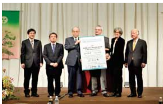
Holding up the signed Ishikawa Declaration