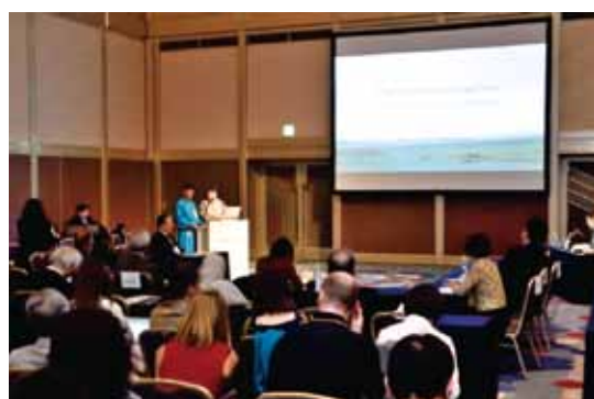
Thematic meeting 2 of the conference

The outcomes of these discussion were summarized in the 2016 Ishikawa Declaration on Biocultural Diversity, which was